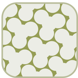
An example of Tactesse® nylon fibers interlocking for denser tufts.