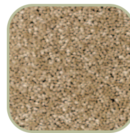
Stained, then cleaned.

So incredibly tough, stains and soil are no match for Tactesse® nylon fiber.